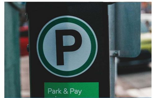
MAXIMIZED PARKING REVENUE