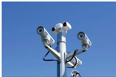
LICENSE PLATE RECOGNITION (LPR)